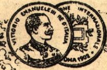
Medaglia di Bronzo