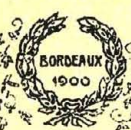
Grand Prix d'Honneur