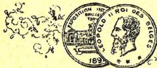
Medaglia di Bronzo